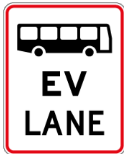
Bus and electric vehicle lane